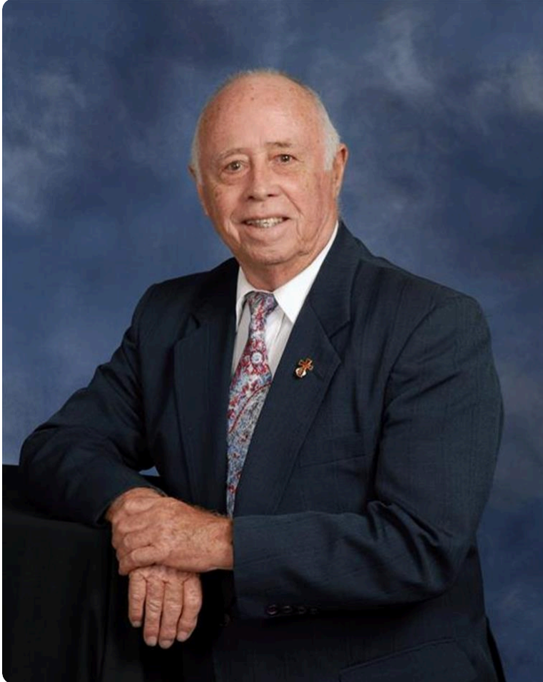
From the 2012 St. Patrick Church Directory